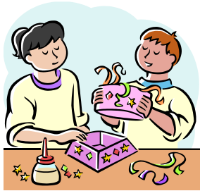
Table Favor Committee

We will not meet in April. Thanks to the women who helped assemble March & April candy cups when we met in March. They look great and will be