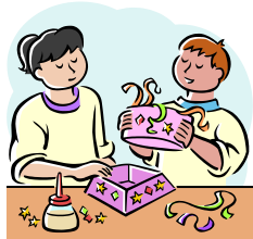
Table Favor Committee

Happy Holidays to all our devoted crafters! Our work is done for this year and we won't meet again until January 2015.