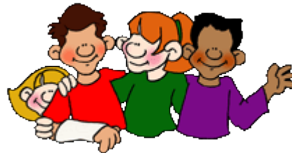
Table Favor Committee

May 10, 1:15 P.M. We will be meeting to assemble patriotic table favors for the next two months. Come join in the fun!