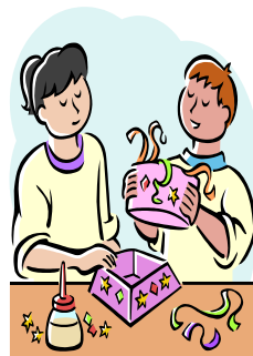
Table Favor Committee

November 10, 1:15pm Thanksgiving table favors will be assembled and filled with candy. Note the earlier time so we are done before school dismisses. Thank you.